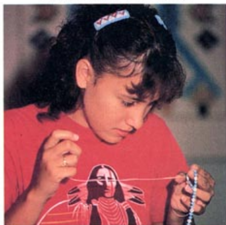
Traditional crafts in Minnesota